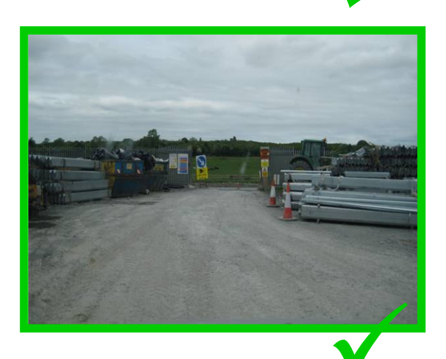
For further information on Health and Safety related issues go to www.hsa.ie