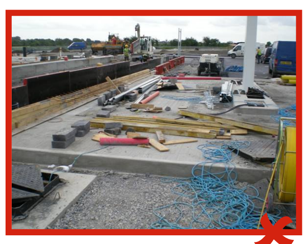
This document contains examples on good practice which are not compulsory but which you may find helpful in considering what you need to do.